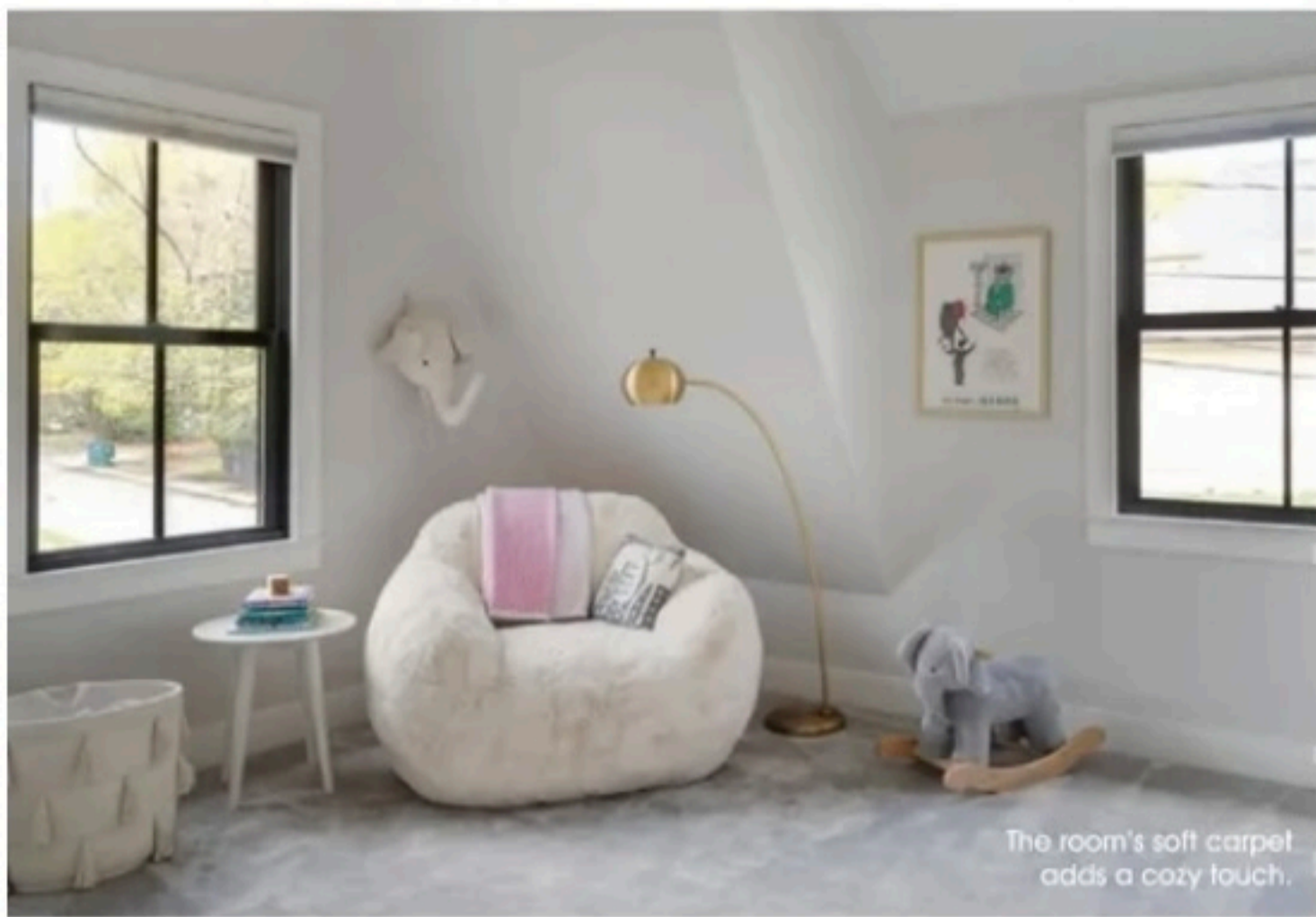
The room's soft carpet adds a cozy touch.