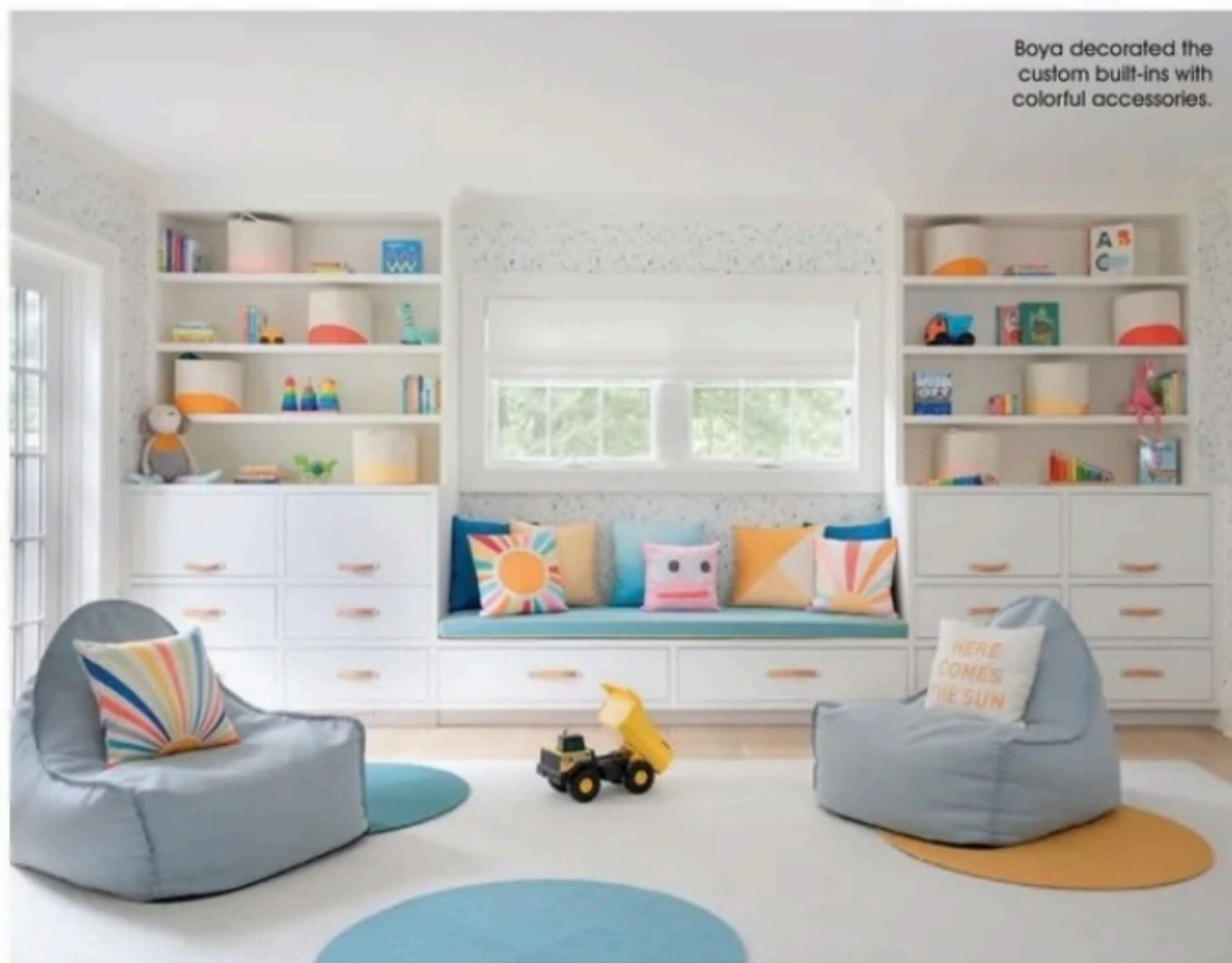
Boya decorated the custom built-ins with colorful accessories.